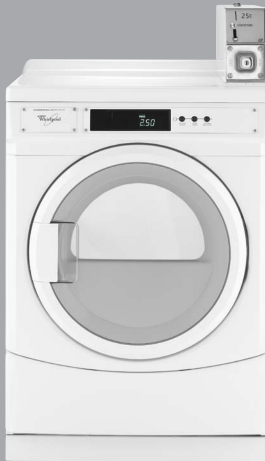
Shown with optional pedestal, coin drop and box.