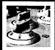
46" GAS DROP-IN COOKTOP E46GC66ESS